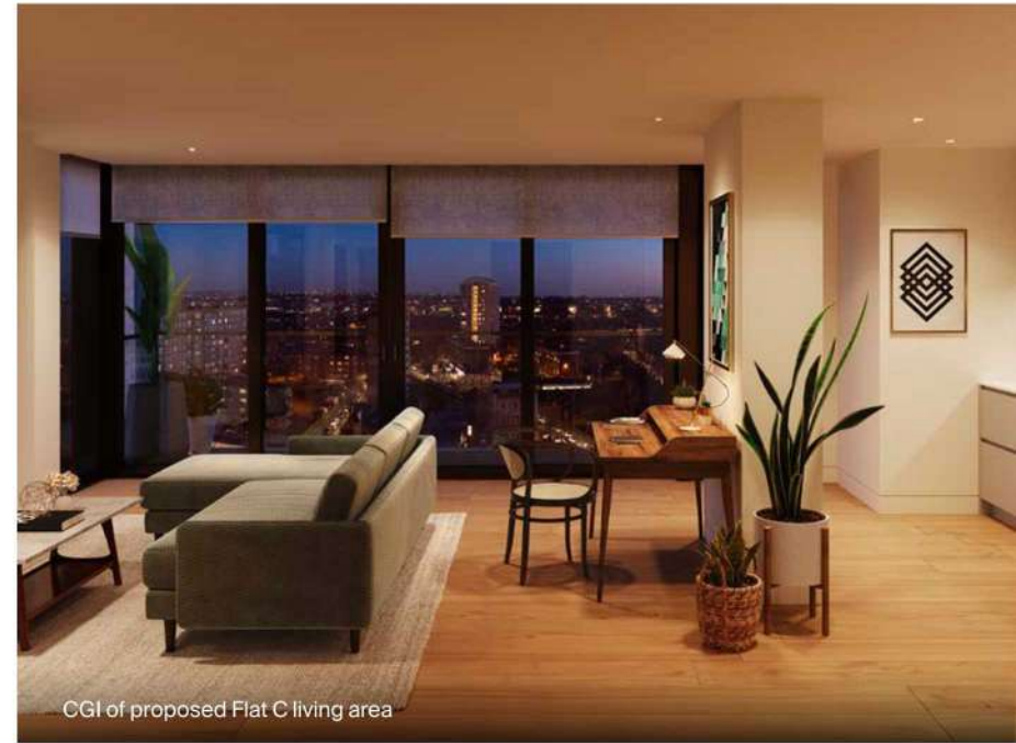
CGI of proposed Flat C living area