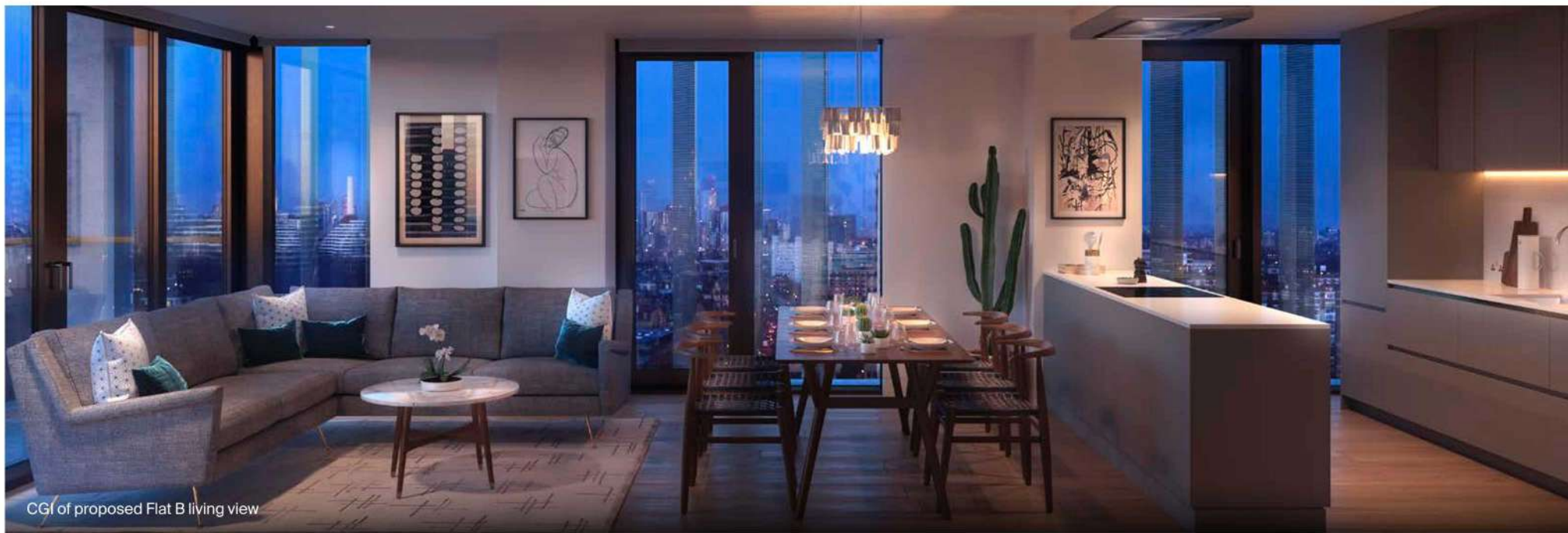
CGI of proposed Flat B living view