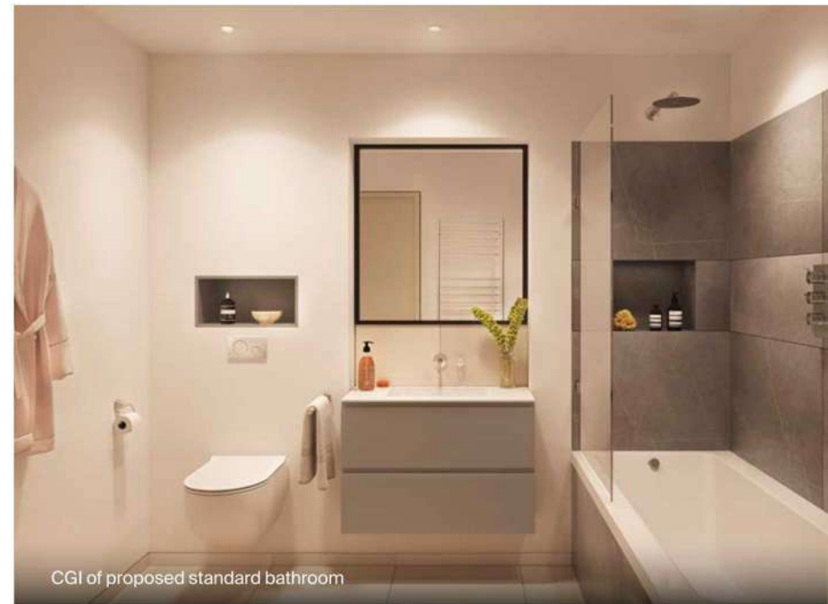
CGI of proposed standard bathroom