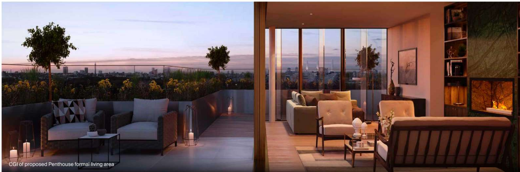
CGI of proposed Penthouse formal living area